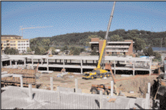
Stillwater Mills on Main Beam, column, and hollow core installation

Molin was consulted during the early stages of the design process and worked with Weis Builders to address all of the requirements for the Stillwater Mills project. Our sales team worked with the design team in the schematic phase to make precast the product of choice. Our estimating and engineering departments worked to achieve the necessary requirements for the 4-story building to meet the owners budget and schedule.