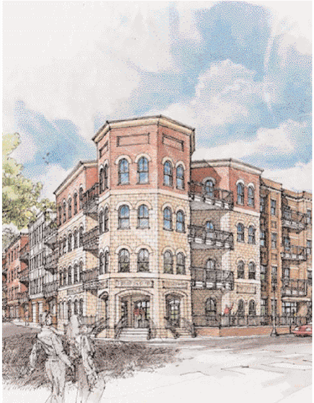
Artist Rendering of Stillwater Mills on Main Stillwater MN