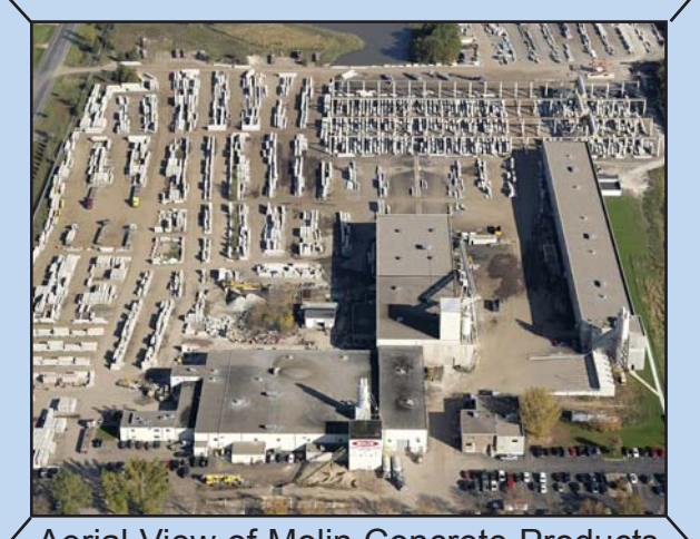
Aerial View of Molin Concrete Products