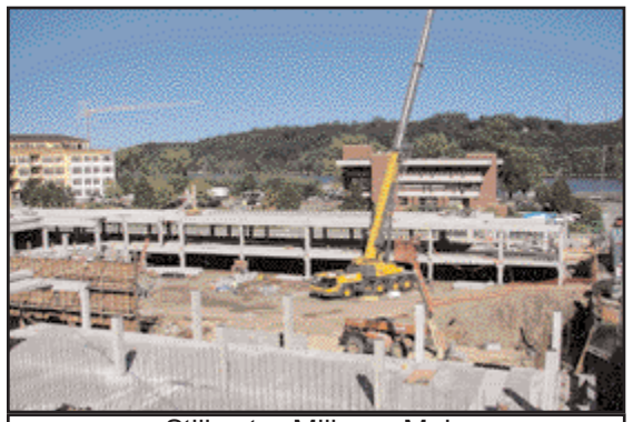
Stillwater Mills on Main Beam, column, and hollow core installation

Molin was consulted during the early stages of the design process and worked with Weis Builders to address all of the requirements for the Stillwater Mills project. Our sales team worked with the design team in the schematic phase to make precast the product of choice. Our estimating and engineering departments worked to achieve the necessary requirements for the 4-story building to meet the owners budget and schedule.