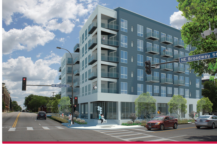
Momentum Design Group

According to Craig Hartman with Momentum Design Group, "We first identified precast concrete wall panels at the base of the building as a method to increase speed of construction on site. Molin was available every step of the way and introduced new ideas to the